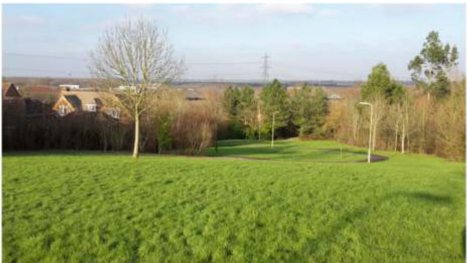
Looking north from Wright Close